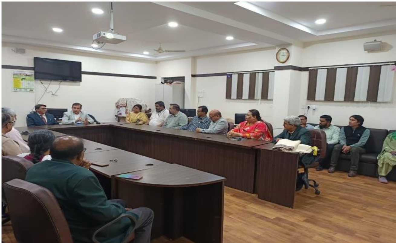
6) Seminar on Industry Institute Interaction