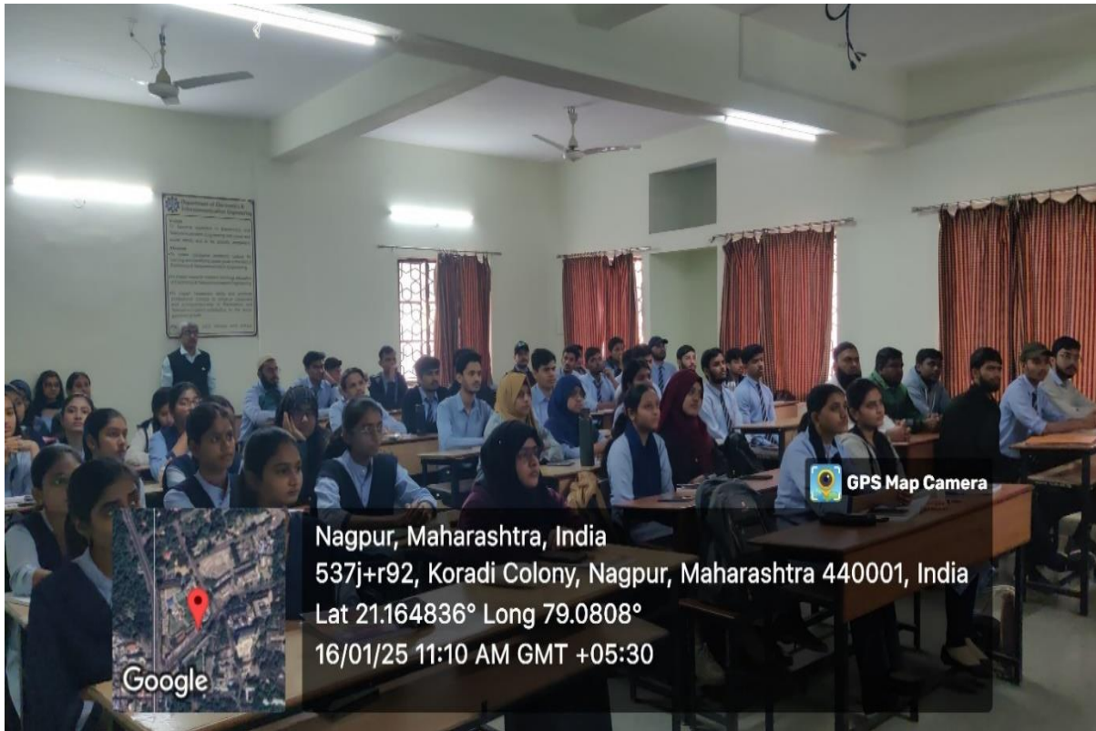
9) Webinar on : "Udyamotsav-2025-Celebrating National Startup Week & National Startup Day" by MoE Innovation cell