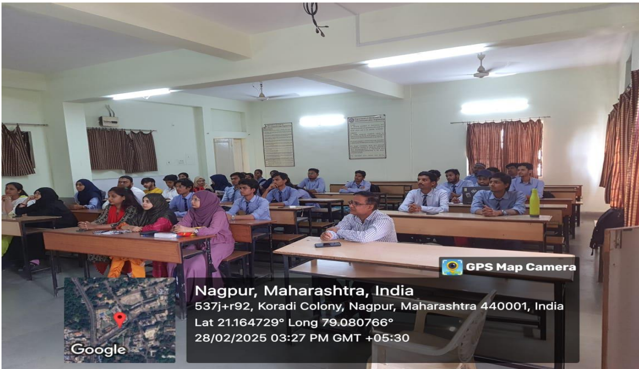
4) National Science Day: Celebrating CV Raman's Birth Anniversary, His work & Achievement