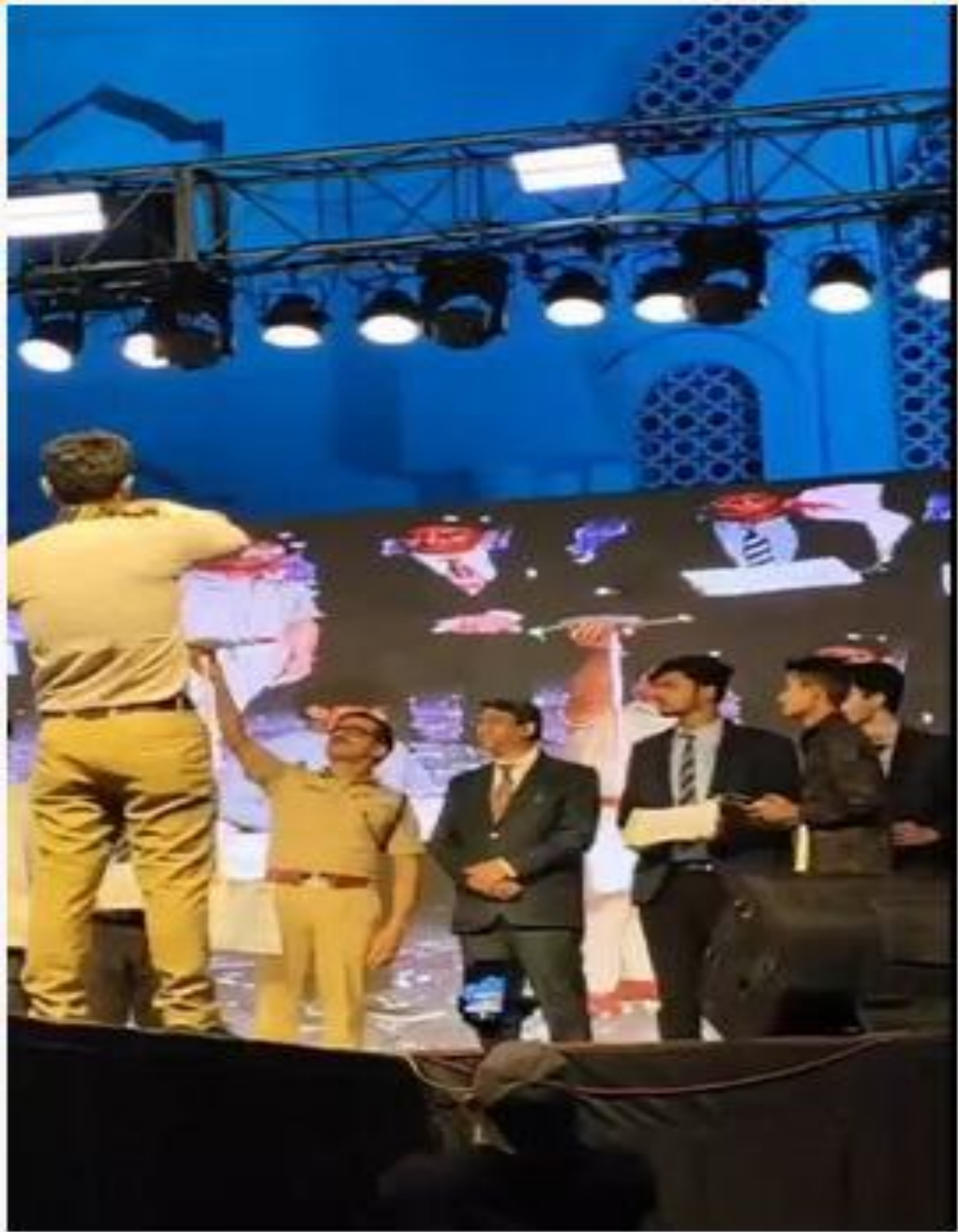
1) Inauguration of the Drone Club "DRONEXT"