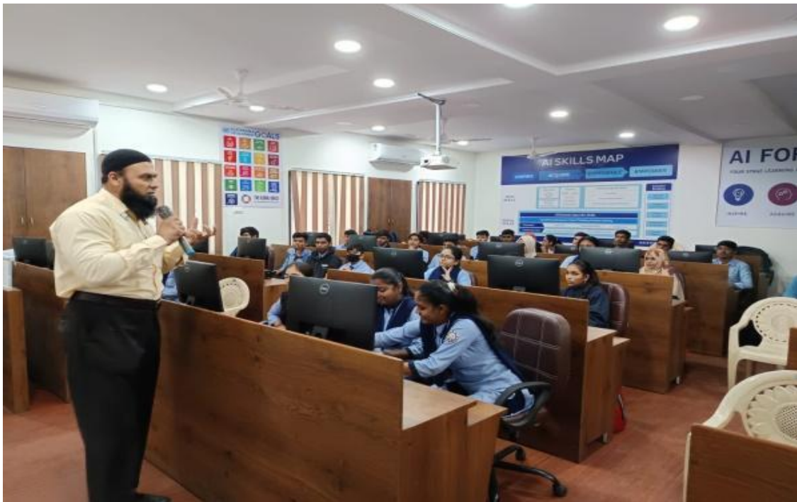
8-Hands on training on Coding and Object Oriented Programming