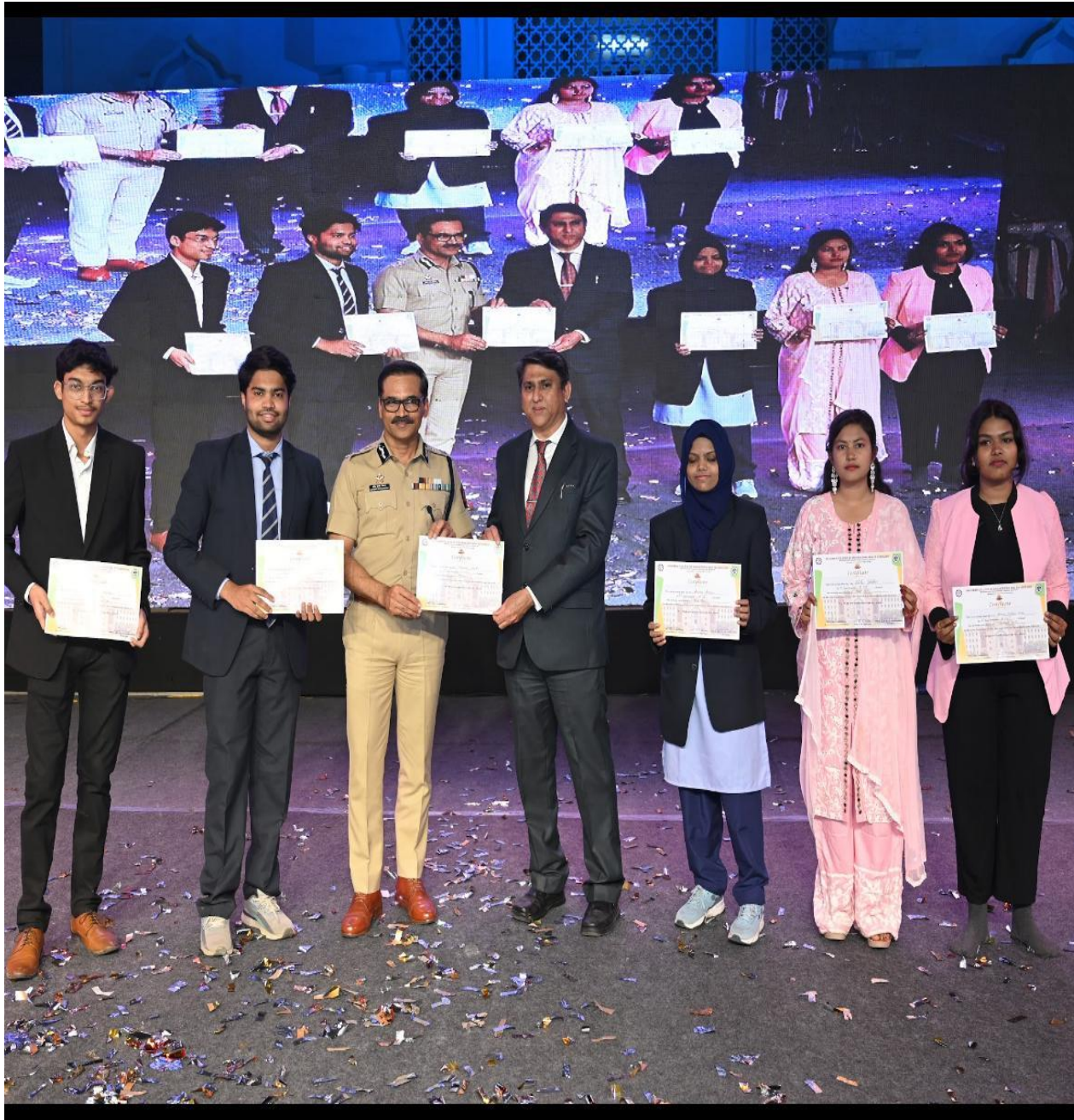
2) Inauguration of Cyber Club “Cyber Sage”