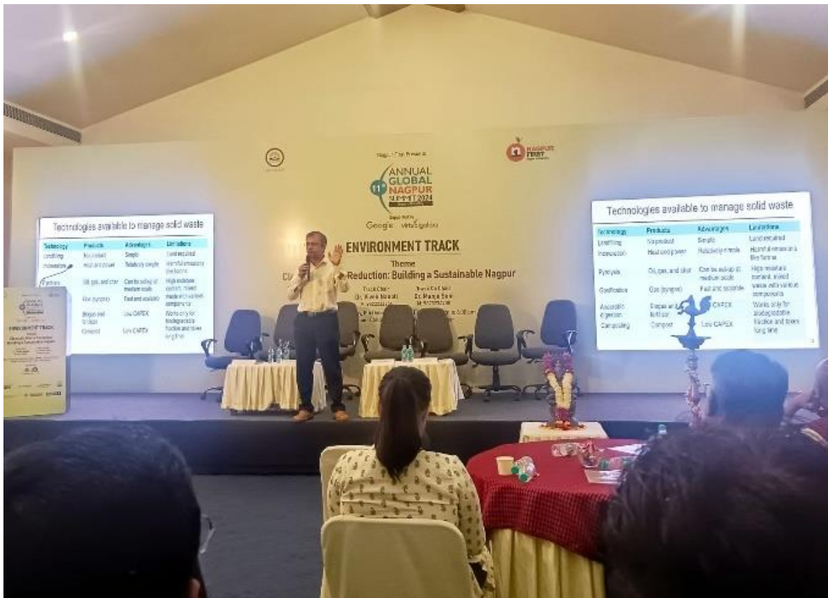
5) Seminar on Environment and Sustainability