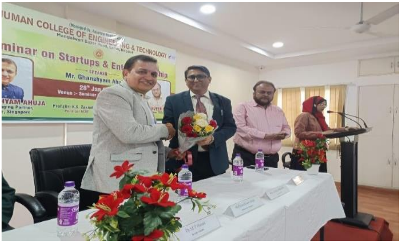
5) Seminar on Startup & Entrepreneurships for student