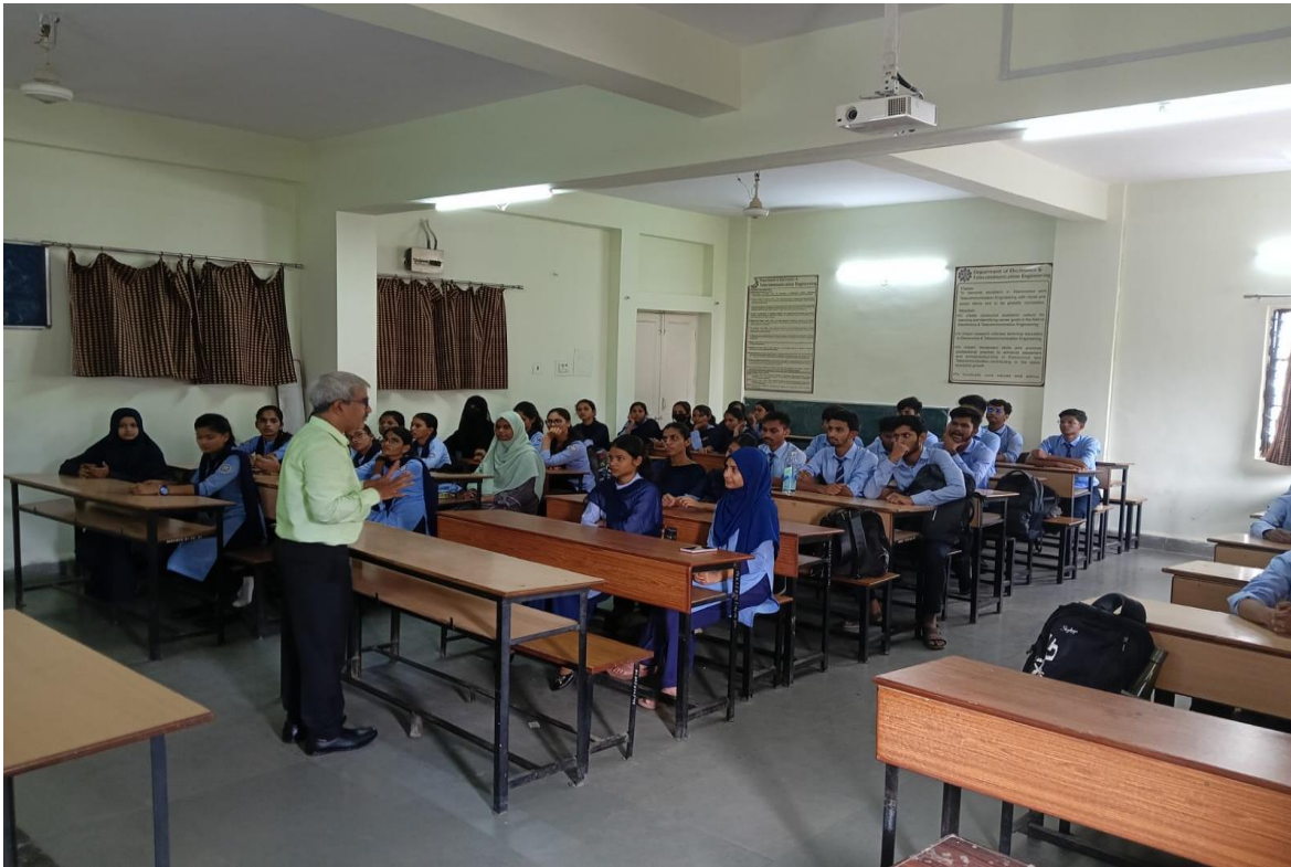
3) Seminar on various scholarships available for an engineering student