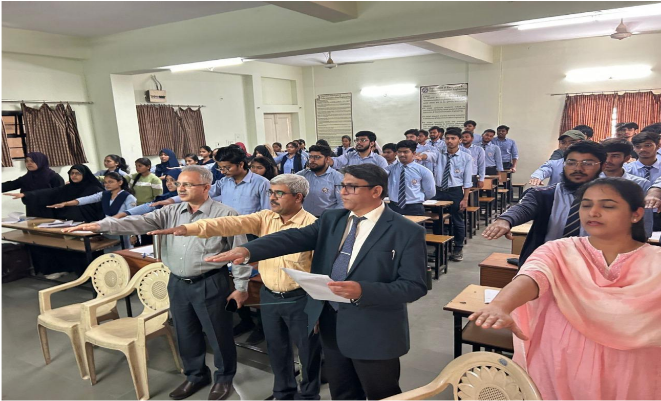
3) Students Activity "AI AFFIRMATION PLEDGE"