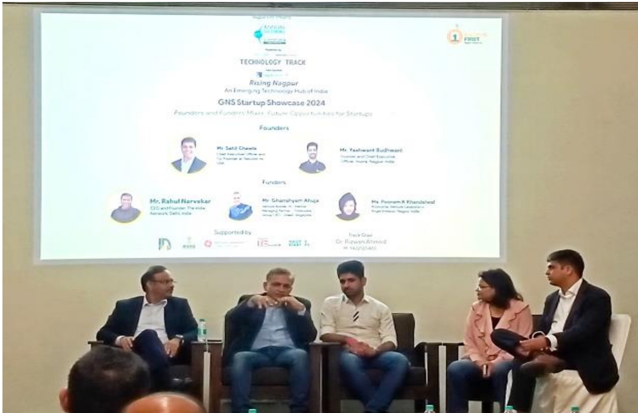
6) Panel discussion under startup showcase