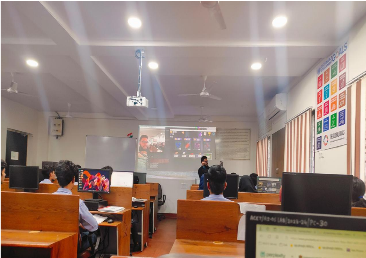
8) Guest Lecture on "Integration of Hardware using AI"