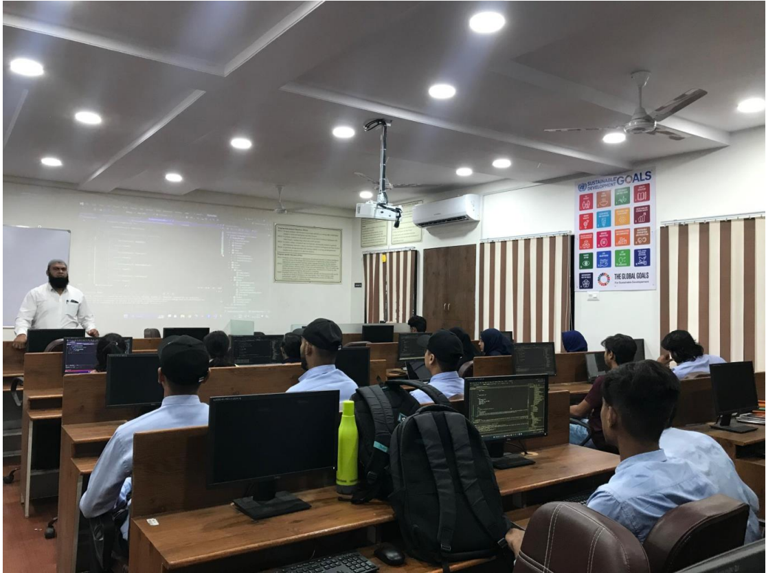
5 days Workshop on “Full Stack Development using Python”