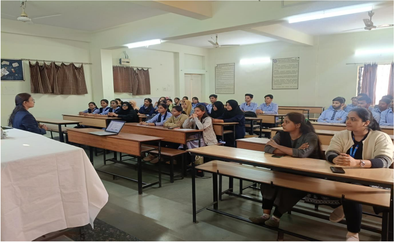
7) Seminar on Fundamental of Data Science