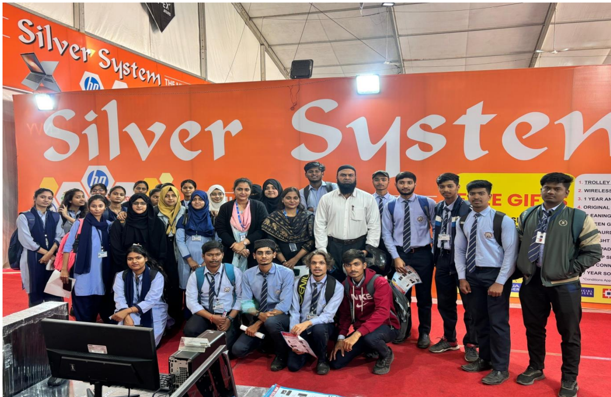
1) Visit to "Central India's Biggest Tech Event, COMP-EX 2025"