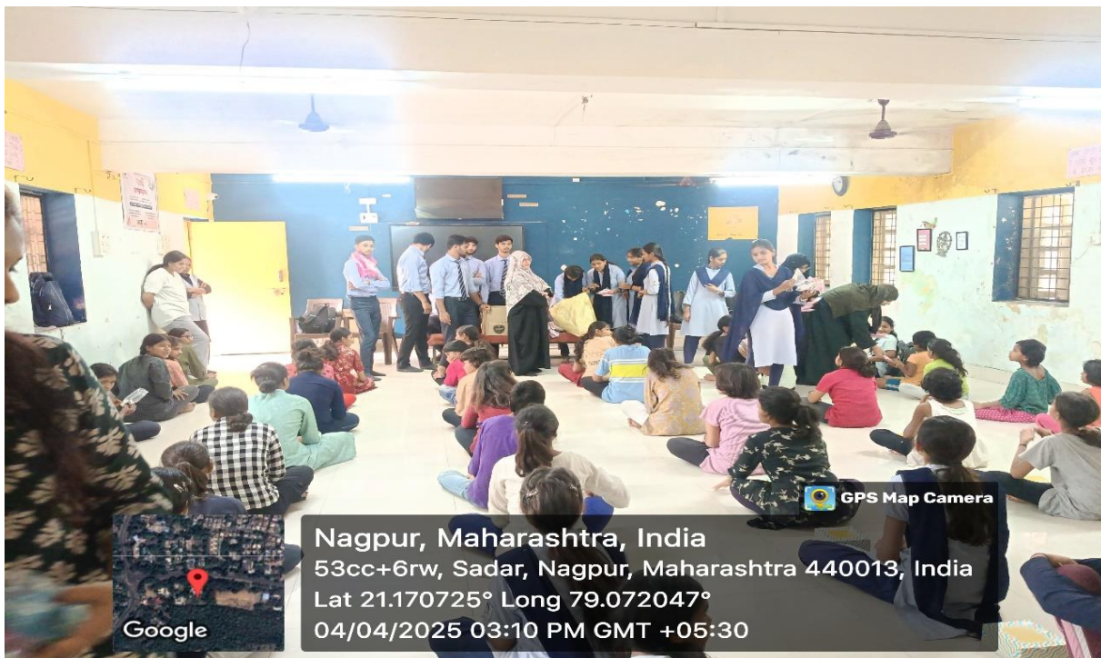
Visit to Girl's Orphanage under outreach activities