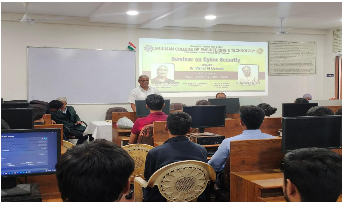
4) Seminar on Cyber Security