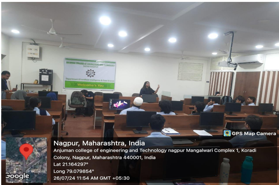
2) Seminar on Overseas opportunities for engineering students