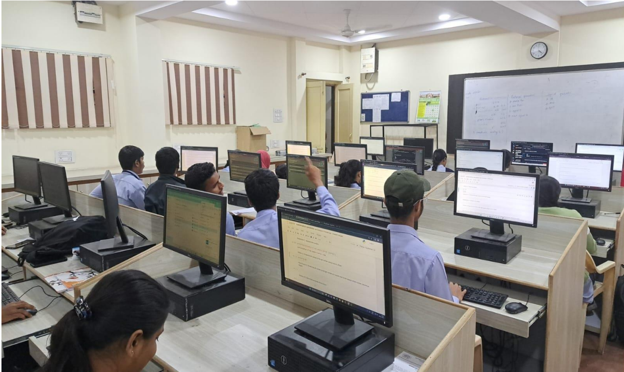
11) Workshop on Fundamental of Python