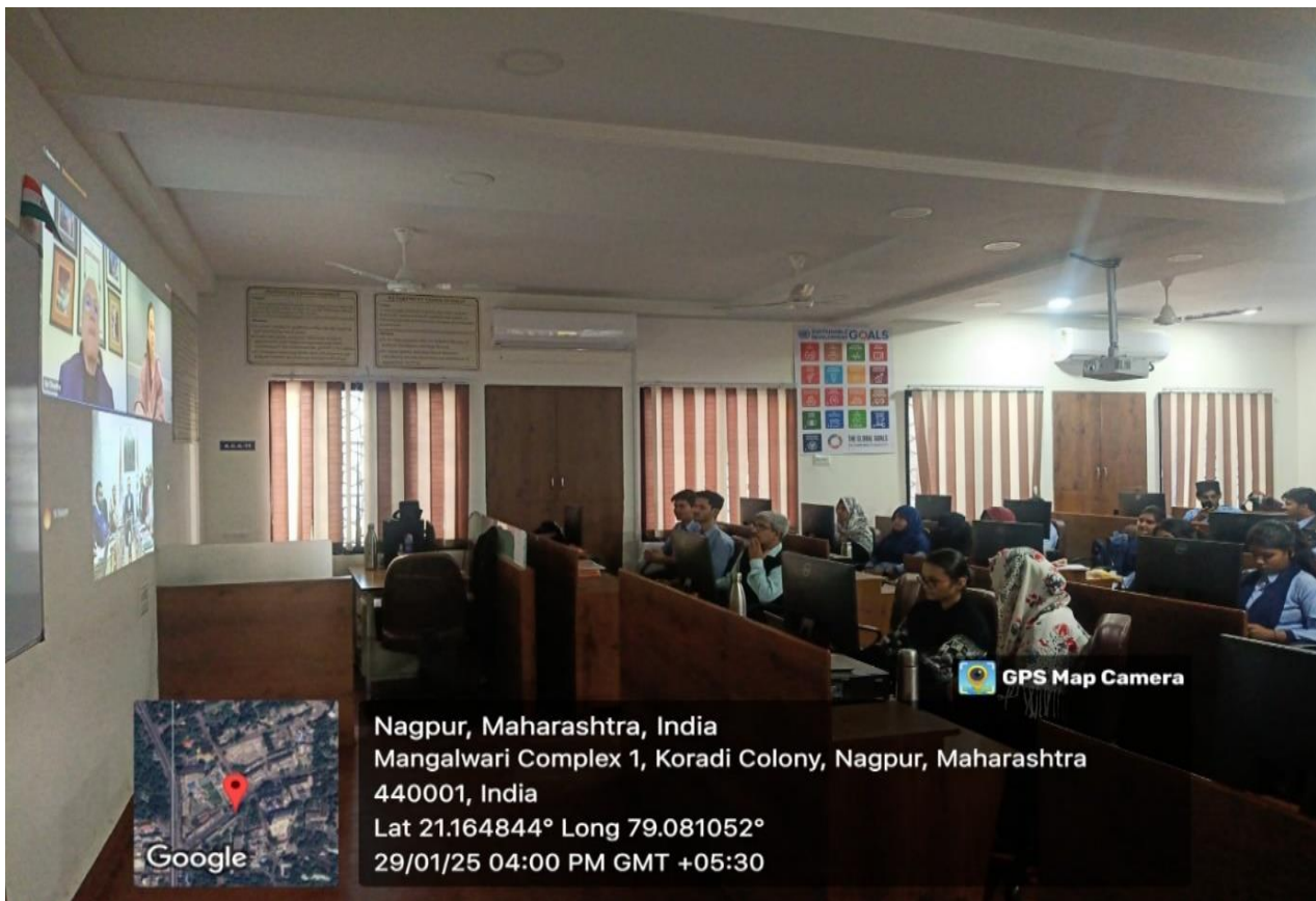
10) Webinar on "2025: The year of AI shaping the future of Education, Research, Innovation & Industry"