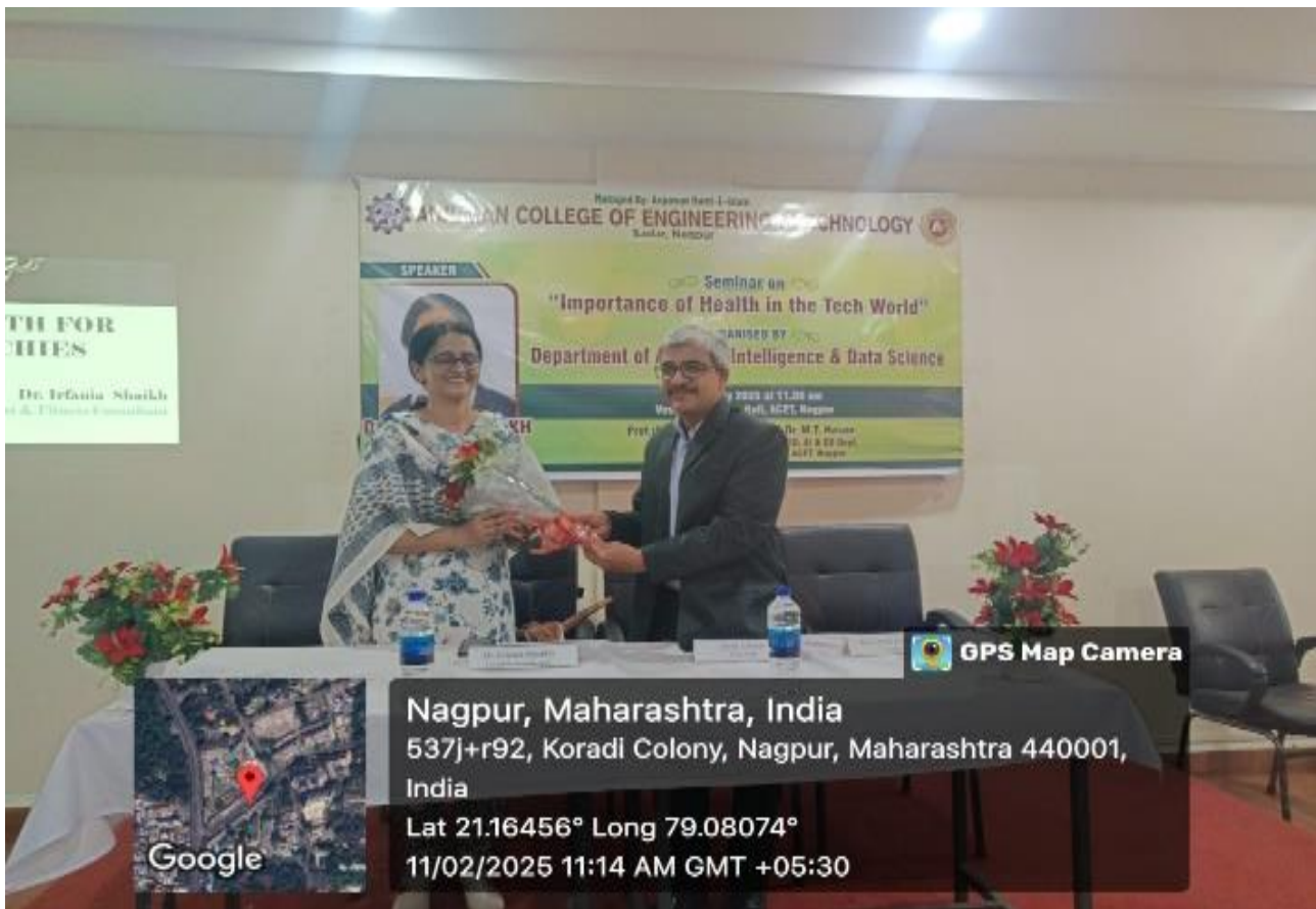
12) Seminar on The Importance of Health in the Tech World for students