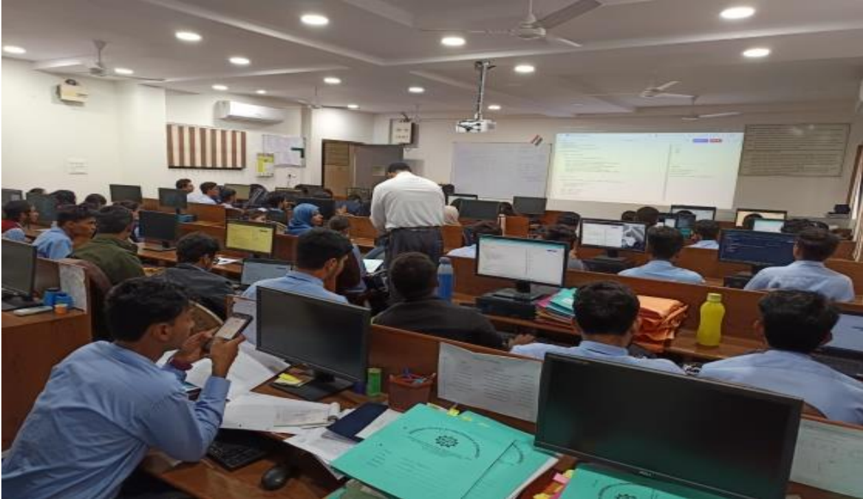
1) Hands on training on “ Intermediate OOP concepts and Practical Application