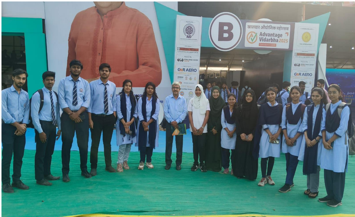
2) Visit to Advantage Vidarbha